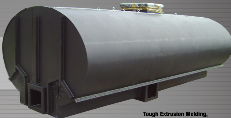
Tough Extrusion Welding, ProSeal Wrap and Recessed Bulkhead

Pro Poly has advanced thermoplastic tank design to include the Elliptical tank built with Pro Poly's exclusive PRO SEAL technology for the toughest water conditions.