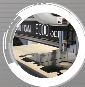
Computerized Router for Exact Dimensions