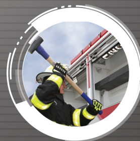
Sledgehammer Tough to Resist Dents