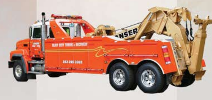
Commercial & Heavy Duty