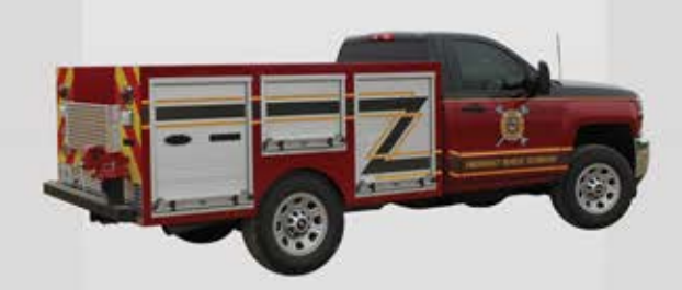
Utility & Light Duty